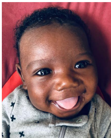
Koa. Adopted from US, July of 2019