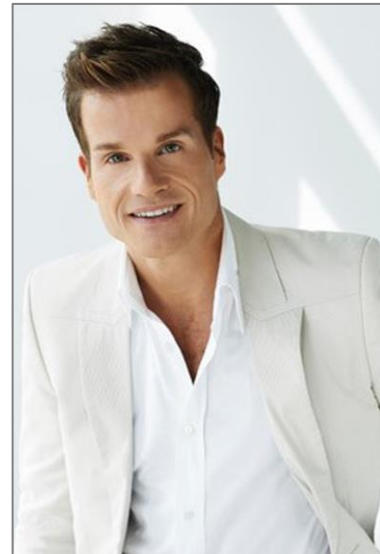
Louis Van Amstel

Three Time Ballroom Dancing World Champion and National Champion